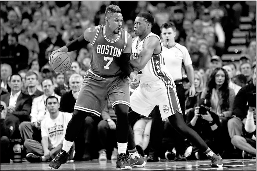
Boston Celtics forward Jared Sullinger dribbles the ball against Philadelphia 76ers power forward Richaun Holmes during the first half at TD Garden in Boston on Wednesday night.

Forward David Lee, also making his Celtics debut, chipped in with eight points, five rebounds and five assists, while forward Jae Crowder scored 14 points and grabbed eight rebounds for the Celtics, who are opening with three straight games at home.