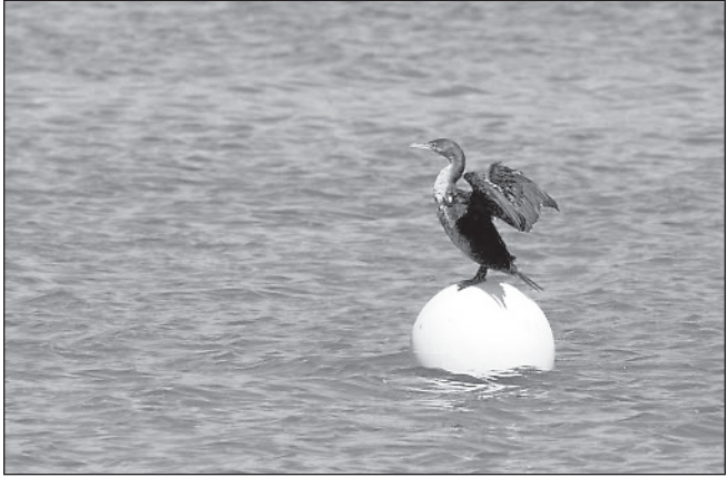
AISLINN SARNACKI | BDN

For information, visit islandheritagetrust.org, where a printable trail brochure and map are available, or call the land trust at 348-2455.