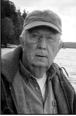
"Always in our hearts."