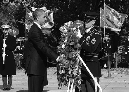
On Veterans Day 2011, President Obama lays a wreath at the Tomb of the Unknown Soldier in Arlington National Cemetery in Arlington, Virginia.

Veterans Day honors both living and dead veterans of the armed services.