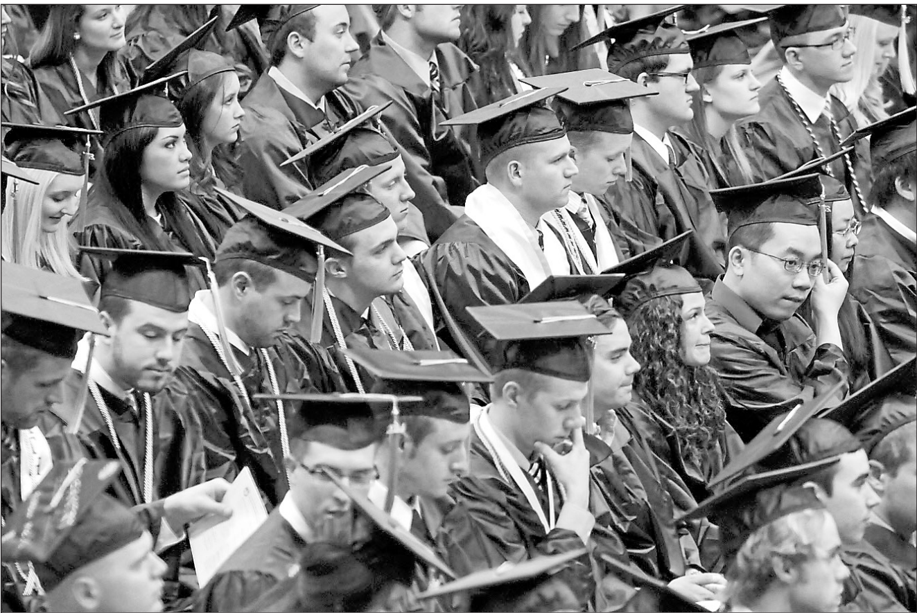
Members of the class of 2014 during the 112th commencement ceremony at the University of Maine in Orono on May 10 2014.