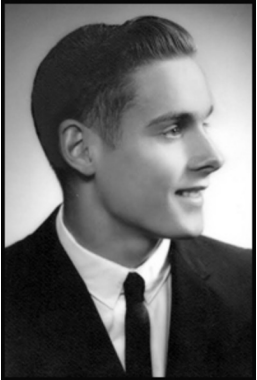
1966 SENIOR PICTURE