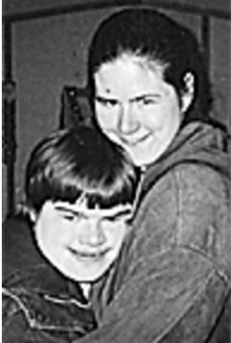
Will always love you Mom