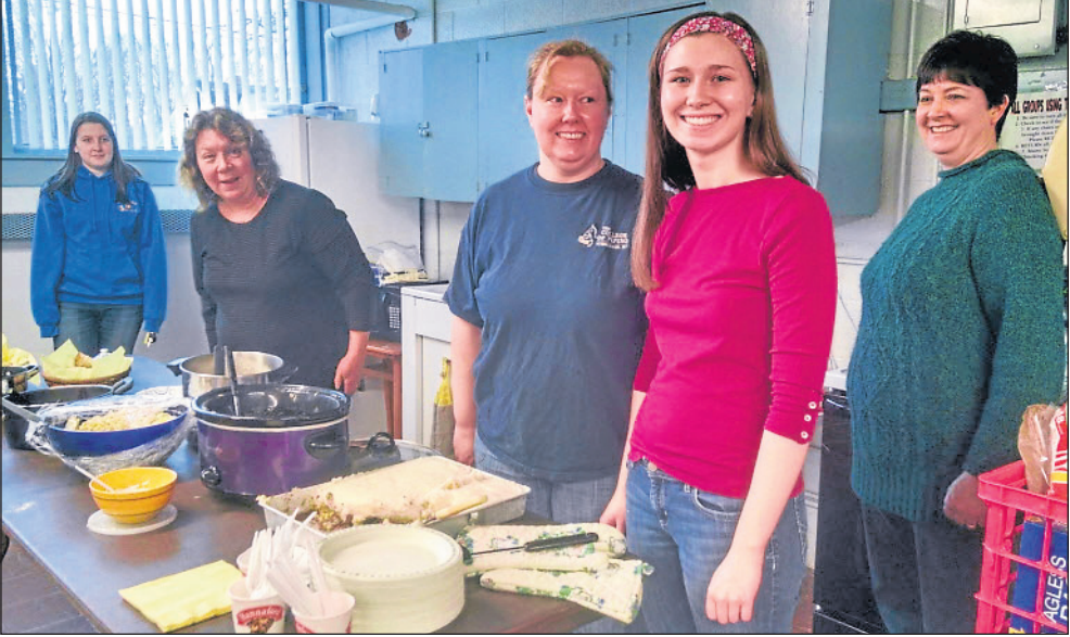
UNIVERSITY OF MAINE COOPERATIVE EXTENSION

The high school junior said she got the idea when she saw a similar dinner