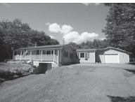
EDDINGTON MOVE IN READY! Charming, sunny ranch on 1.67 acs with 2-car garage. Many updates! $149,900 ERA Dawson 417 Main St, Bgr 944-3361 TriciaQuirk.com