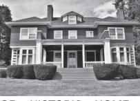
BANGOR HISTORIC HOME Wilfred Mansur design; 8 fireplaces, 5 BRs w/en suites; guest apt. Across from EMMC. $1,195,000 ERA Dawson 417 Main St, Bgr 944-3361 TriciaQuirk.com