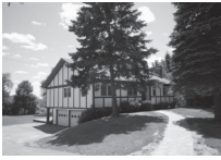
BANGOR Spacious 4BR/2.5BA ranch w/ large kitchen, 3 fireplaces, sunroom. Many recent improvements. $195,900 ERA Dawson 417 Main St, Bgr 944-3361 TriciaQuirk.com