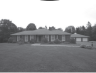
HERMON Meticulously maintained ranch w/spacious rooms on 6.9 ac with two 3-C garages. $347,000 ERA Dawson 417 Main St, Bgr 944-3361 TriciaQuirk.com