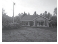
CORINTH Nicely updated home on spacious & beautifully landscaped lot. Open living w/1 flr living if desired. 3 car gar. $159,900 Kurtis & Carissa Marsh, Realty of Maine, 942-6310