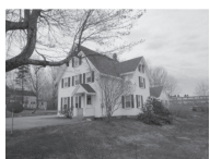
HAMPDEN 5 BR/3 BA w/at 2 car gar. Lg back yard w/ gazebo & fountain. Updated incl. new furnace, vinyl wins. & siding. $164,900, Kurtis & Carissa Marsh, Realty of Maine 942-6310