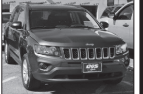
2015 JEEP COMPASS Full Factory Warranty, 4X4, keyless entry, alloy wheels,