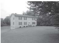
BRADLEY Priced to sell! Newer 3BR, 3 BA Colonial, 3300+ sqft gar. Spacious rms, deck overlooking pvt back yard. Easy access to Bangor & UM. $199,900 Kurtis & Carissa Marsh, Realty of Maine, 942-6310