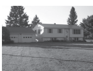
CHARLESTON Attractive country home & lot 3 br, newer appliances. $118,500 Century 21 Queen City Real Estate, 416 Hammond St., Bangor, 207-942-4618