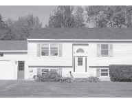
HAMPDEN 20 Daisey In. 3 BR 2BA. HB Smith furnace, MasterGaurd fire system & Generac Guardian generator, gas stove for back up heat. Lg rear deck. 2 car gar. & storage shed. $189,000 Phil Adams Adams RE 944-1672