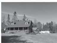
HAMPDEN 3 BR/2 BA custom built Home, sunrm, f.p. Daycare Ctr w/great income, solar panels, in ground pool, exercise rm. $259,999 Jean Jenkins, 745-4522 www.jeanjenkins.com