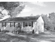
GLENBURN Meticulously cared for, many recent upgrades incl. 22x28 finished basement, shingles, deck, generator hookup & flooring. $134,900 The Fish Team, Carolyn Fish, 944-8466