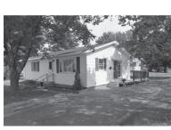
LINCOLN 3 BR chalet w/open flr plan, unfinished basement for lots of storage space, 24x24 2 car gar., pvt yard. Lots to offer at an affordable price! $114,900 The Fish Team, Carolyn Fish, 944-8466