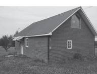
SHERMAN 2 cabins, 30 acs, beautiful views of Mt. Katahdin. 28x32 cabin w/ lofts, LR, BA, kit & 1 BR cabin w/ kit. & BA. Heat, water, septic & power. Small pond! $55,000 Scot Walker, 538-1765 www.maineandbroker.com