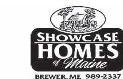
REDMAN 2015 46627 880 SF HICKORY KITCHEN for only $51,907 delivered & set up! BEST SELLER!! Call 989-2337 www.showcasehomesofmaine.com