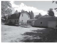
EDDINGTON Dutch gambrel, many fresh updates, lg kit. & LR, 4BR, 2 car gar. 1.5 ac., 20x27 barn, 10x20 shed, circular driveway. $190,000 Dottie Boynton, Realty of Maine, 852-2233