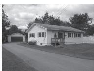
ORRINGTON Nice 3br ranch, 2 car garage, pellet stove. $139,800 Century 21 Queen City Real Estate, 416 Hammond St., Bangor 207-942-4618