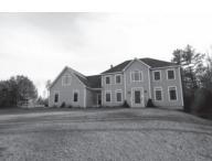
HAMPDEN Hawthorne Ridge Contemp. colonial 4BR/2.5BA, open flr pln, 9' ceilings, lg sunny lot, great schools $389,900 ERA Dawson 417 Main St, Bgr 944-3361 TriciaQuirk.com