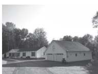
LEVANT Custom built ranch, open flr plan w/laminate wd flrs & tile, breakfast nook, MBR, Whirlpool tub. 3 acs! $200,000 Vacationland Realty, Jean Jenkins, 745-4522 jeanjenkins.com