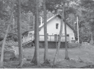
ISLAND FALLS 2 BR/1 BA, on one of, if not the most private lots on west end of Pristine 1,900 ac Pleasant Lake. Like new cond. w/lg deck, 16' plus cathedral ceiling, over-sized loft, lg open kit/din/ living rm. $204,900 Scot Walker, 538-1765 www.maineandbroker.com