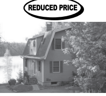
DEDHAM 985 Bald Mountain Road, 3BR/2.5BA, on Harriman Pond, fireplace, security system, carpet & hwd floors, appliances incl., ctrl heating, deck/porch, 2 car gar, office/den, walk-out basement. $279,000 Call 207-469-1046 or 207-469-1103 For more info, and photos use Listing ID 23951131 and go to www.forsalebyowner.com