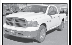
2015 RAM 1500 Big Horn Package, 21 MPG, 4X4 Bluetooth, Hemi, 23,000 Miles D&S Price: $30,990