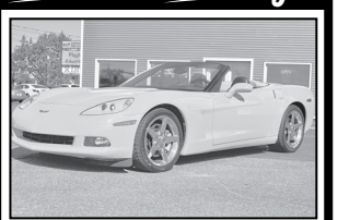
2005 CHEVROLET CORVETTE Convertible, Flawless! Velocity Yellow, 20,000 Miles D&S Price: $29,990