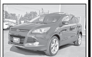
2014 FORD ESCAPE Titanium, AWD, Panoramic Roof Navigation, Backup Camera, 31,000 Miles D&S Price: $22,990