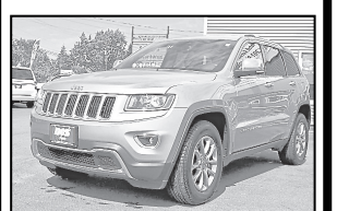
2015 JEEP GRAND CHEROKEE 4X4, Limited, Leather, Htd Seats & Steering Wheel, Warranty, 38,000 Miles D&S Price: $30,990

510 Wilson St., Brewer 207-989-0300 www.dandsauto.com