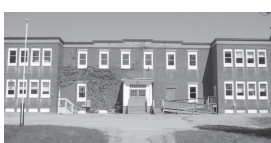
HARTLAND ACADEMY 21,600 s.f. for residential or commercial use, 2.3 acres, panoramic views, sunny exposure, hardwood floors, new roof, electrical upgrades, outbuilding, daylight basement, 500 ft. road frontage. Maintenance free exterior. Endless possibilities. $79,900. Possible owner financing. Call 284-5553 evenings.