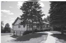
BANGOR Spacious 4BR/2.5BA ranch w/ large kitchen, 3 fireplaces, sunroom. Many recent improvements. $186,995 ERA Dawson 417 Main St, Bgr 944-3361 TriciaQuirk.com