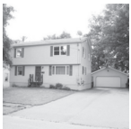
BANGOR Wow! 1872 sqft, lg rms. 2BRs on 1st flr. 5BR/2BA home, rec. rm., hd-wd flrs, deck, hot top drive, 2 car gar. Asking $155,000. Call Dave, 745-8118, Pro Realty