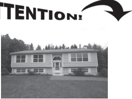
HERMON 3 BR/2 BA open concept, MBR suite, finished lower level, 2-C heated garage, 1.21 acres. $219,000 ERA Dawson 417 Main St, Bgr 944-3361 TriciaQuirk.com