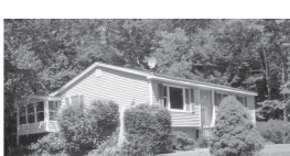
HOLDEN 3BR/1BA, 1976 RR updated less than 10 yrs ago w/wd flrs., new 3.5 car gar. New roof Sept. 2015. $159,000 Gary Eastman, 944-0249, Better Homes and Gardens The Masiello Group