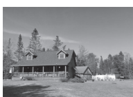
HAMPDEN 3 BR/2 BA custom built Log Home, sunrm, f.p. Daycare Ctr w/great income, solar panels, in ground pool, exercise rm, $259,999 Jean Jenkins, 745-4522 www.jeanjenkins.com