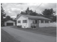
ORRINGTON Nice 3br ranch, 2 car garage, pellet stove. $139,800 Century 21 Queen City Real Estate, 416 Hammond St., Bangor 207-942-4618