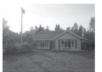
CORINTH Nicely updated home on spacious & beautifully landscaped lot. Open living w/1 flr living if desired. 3 car gar. $159,900 Kurtis & Carissa Marsh, Realty of Maine, 942-6310