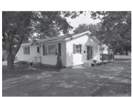
LINCOLN 3 BR chalet w/open flr plan, unfinished basement for lots of storage space, 24x24 2 car gar., pvt yard. Lots to offer at an affordable price! $114,900 The Fish Team, Carolyn Fish, 944-8466