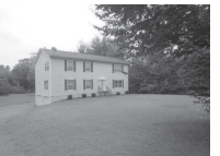
BRADLEY Priced to sell! Newer 3BR, 3 BA Colonial, 3300+ sqft gar. Spacious rms, deck overlooking pvt back yard. Easy access to Bangor & UM. $199,900 Kurtis & Carissa Marsh, Realty of Maine, 942-6310