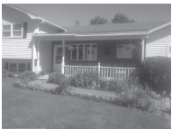
CORINTH Spacious tri-level on 4.8 acs, well landscaped, family rm, central vac, brick hearth w/wd stove, heated gar, workshop, barn for storage. $189,900 John Voye, 852-6056, Realty of Maine