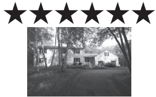
BREWER Elegant Colonial, custom cherry kitchen, spacious rooms, 2+ car, 2.82 acres. $297,623 ERA Dawson 417 Main St, Bgr 944-3361 TriciaQuirk.com