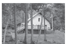
ISLAND FALLS 2 BR/1 BA, on one of, if not the most private lots on west end of Pristine 1,900 ac Pleasant Lake. Like new cond. w/lg deck, 16' plus cathedral ceiling, over-sized loft, lg open kit/din/ living rm, $204,900 Scot Walker, 538-1765 www.maineandbroker.com