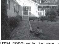
PLYMOUTH 1992 m.h. in exc. cond., 3 BR, 2 BA, screened in deck, 2 car detached gar., close to interstate, priced to sell. $79,900 John Voye, 852-6056, Realty of Maine

NEW 2015 EAGLE RIVER 1,280 sqft, 3 BR, 2 BA, SAVE $5,000! Was $74,714 NOW ONLY $69,714! Call 989-2337 Web www.showcasehomesofmaine.com!