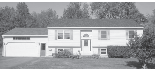
HAMPDEN 20 Daisey In. 3 BR 2BA. HB Smith furnace, MasterGuard fire system & Generac Guardian generator, gas stove for back up heat. Lg rear deck. 2 car gar. & storage shed. $189,000 Phil Adams Adams RE 944-1672