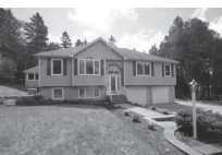
EDDINGTON 3BR/3BA, granite counters, HW floors, gas fireplace, lg lot, deck, w/covers. A copy of the application and supporting documentation may also be seen at the municipal office in Bangor, Maine.