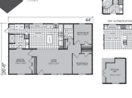
PLYMOUTH 1992 m.h. in exc. cond., 3 BR, 2 BA, screened in deck, 2 car detached gar., close to interstate, priced to sell. $79,900 John Voye, 852-6056, Realty of Maine