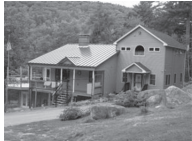
DEDHAM 4 BR/3 BA contemporary on Phillips Lake. SS appliances, granite countertops, two f.p.s, gas inserts, close to Bangor, great view of lake, 2 car gar. & totally rebuilt in 2012. $550,000 John Voye, 852-6056, Realty of Maine