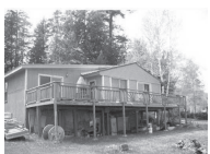
WESTON 3 BR/1 BA yr round w/150 ft Deering Lake, less than 20 Feet to the waters edge. Swim, boat, fish and relax! $89,500 Scot Walker, 538-1765, mainelandbroker.com