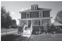
BANGOR Charming 3BR Colonial, updated granite kit, enclosed porch, 2C garage, A½ ac in town lot. $249,000 ERA Dawson 417 Main St, Bgr 944-3361 TriciaQuirk.com