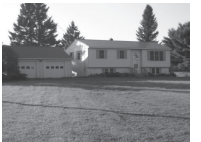
CHARLESTON Attractive country home & lot 3 br, newer appliances. $118,500 Century 21 Queen City Real Estate, 416 Hammond St., Bangor, 207-942-4618