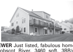
BREWER Just listed, fabulous home on Penobscot River. 3460 sqft, 3BR/4BA, family rm, f.p., 2 car gar., deck. Sweep-ing river views. Priced below cost at $299,000 Call Dave 745-8118, Pro Realty