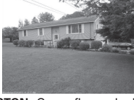
EDDINGTON Open floor plan! 3 BR/2BA, hdwd flrs, 2 car gar. 12x16 shed, paved drive, close to all amenities. 1.75 ac lot, open deck. $199,900 Dottie Boynton, Realty of Maine, 852-2233