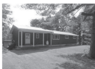
GREENBUSH 1 flr. living, updated, heat pump gives cheap heat & A/C. New paint, boiler & on demand HW, newer metal roof, spacious backyard. $114,900 Kurtis & Carissa Marsh, 942-6310