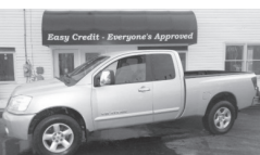
NISSAN TITAN 07 XE 4WD AT 148K *EZ CAR CREDIT! YOU'RE APPROVED!* >>>>GARRETSAUTO.COM<<<< 1A, 2mi fr/Brewer Walmart 989-6777