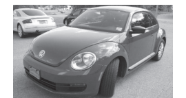
VOLKSWAGEN 2012 BEETLE 33K Miles, Auto, $13,960. Crawford's Import Auto, 862-3971