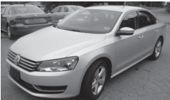
VW 2012 PASSAT - AT 18k mi., leather, factory warr. $17,875 Crawford's Import Auto, 862-3971