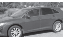
TOYOTA 2011 VENZA LE 4 cyl. AT, FWD, 30 mpg, like new cond., very little winter use, 44,700 miles. $17,900. 207-234-2134 or 207-356-2158