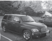
CHEVROLET 2006 HHR LT Blue , Exc. cond., heated, leather, moonroof, keyless entry, remote start, 32mpg. 57k miles, $7899 OBO. 944-7560.