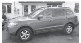
HYUNDAI 08 SANTA FE AWD AT 126K *EZ CAR CREDIT! YOU'RE APPROVED!* >>>>GARRETSAUTO.COM<<<< 1A, 2mi fr/Brewer Walmart 989-6777