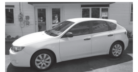
SUBARU 08 IMPREZA AWD 4C AT 138K *EZ CAR CREDIT! YOU'RE APPROVED!* >>>>GARRETSAUTO.COM<<<< 1A, 2mi fr/Brewer Walmart 989-6777