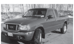
FORD 2004 RANGER 4 x 4, ex. cab, drive it everyday. $4,700. 207-974-8818

The State of Maine Department of Defense, Veterans and Emergency Management, Directorate of Facilities Engineering, has a requirement for Snowplowing and Sanding Services for the Calais Armory, 53 Calais Avenue, Calais, Maine 04619. In accordance with State procurement practices, the Department is hereby announcing the publication of a Request for Proposals (RFP) #201508149 for the purchase of the aforementioned services.