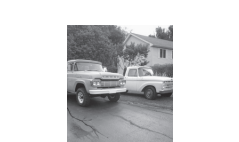
AZ TRUCKS. 1959 F100 4x4 292 V8. 1965 F250 Camper Special rebuilt 352 V8. $9250 for the 59, $7250 for the 65. $9,250.00 207-944-3599