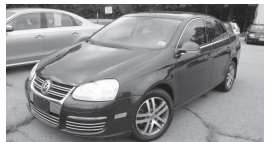
VW 2006 JETTA 2.5, Auto, 99K Miles, $7,373. Crawford's Import Auto, 862-3971