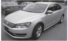
VW 2013 PASSAT - AT 25K MI., Leather, Factory Warr. $17,129 Crawford's Import Auto, 862-3971