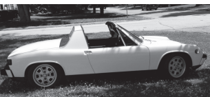
PORSCHE 914 1.8L 1974 49,000 original miles, new sound system, AM/FM/CD/MP3 with remote, 5 new tires, $6,500. Old Town, 469-8013