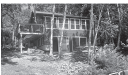
ISLAND FALLS 3BR/1BA, Pleasant Lake home, easy year-round road access, remodeled. Great swimming and boating! $225,000 Scot, 538-1765 www.northernmainelandbroker.com