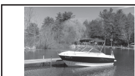
BAYLINER 2009 DISCOVERY 192 (CUDDY CABIN) Blue 240HR, Excellent condition. 19' 4.3L, 2 rod holders, Garmin chart plotter, sleeps 2, trailer w/disc brakes. $21,900 207-944-3772