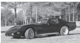
CHEV 1974 CORVETTE 350 motor, performance cam, low stall torque converter, quick shift trani,new interior, carb, gas tank and more. Needs paint. $7500 firm. 538-9637/snowpytle@yahoo.com

CADILLAC 1983 ELDORADO 2DR coupe, stainless top, red leather int. in storage since '99 no rust. $2500 Or Offer 765-3332 afternoons & evenings Lv. Msg