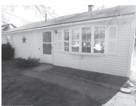
BANGOR Move-in ready 3BR! Priced to sell quickly. Very eff. w/low utilities. Nice back yard, deck, storage bldg & spacious, open concept. Built in 2013. MLS#1267463 $218,500. BHG Masiello Ansley Moore 745-4490 Gayle Treworgy 745-3333