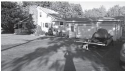
BANGOR 3 BR, 2 car gar. Back yard incl. lg deck, custom greenhouse & big, well landscaped lot. Ex. finished space in basement. $189,90 Scot Walker, 538-1765 www.maineandbroker.com

BANGOR 4 BR/2 BA Antique single family farmhouse with updated addition that can be used as mother in law apartment or included to provide spacious living (Approx. 1900sf). Property includes out building for all your toys. 37+ acres located close to shopping and recreation (City Forrest) $315,000 602-316-3230