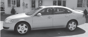
CHEVY 08 IMPALA SS 4DR V8 AT 92K *EZ CAR CREDIT! YOU'RE APPROVED!*

--->GARRETTSAUTO.COM<--- 1A, 2mi fr/Brewer Walmart 989-6777