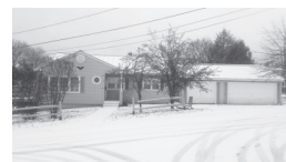
BREWER Nice Ranch home, 4 car gar., new furnace & roof. Great location, Es- tate Sale! Asking $129,900 Dave Giroux, 745-8118, Pro Realty, 947-6463