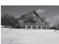
PATTEN 3+ ac cape. Views of Mt Katahdin. 2 car gar. & storage. Granite, vaulted ceiling, MBR, Oil & Pellet furn. & heat pump! $209,900 Scot Walker 538-1765 www.maineandbroker.com