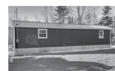
LAKEVILLE 32 pvt acs w/12x44 cabin (insulated & heated). Power w/access yr round. Septic & Well. Has full BA! Seller Financing avail. $54,900 Scot Walker 538-1765 www.maineandbroker.com