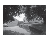
ORRINGTON Well landscaped, 3 BR 1 BA w/gar. Detached in-law apt. w/gar. Spacious deck, screen porch & dog ken- nel $174,900 Kurtis & Carissa Marsh, Realty of Maine 942-6310