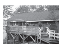
T1 R9 WELS Spectacular views of Mt. Katahdin. Sits on the 5 lake chain all near Baxter State Park. 3 BR & loft. En- closed porch over looking Ambajelus Lake. $159,900 Nadeau/Bragdon Team, ERA Dawson, 723-1441 / 447-0701