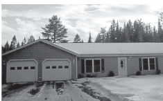
HUDSON 3 BR 2BA. 2900 Hudson Rd. One level, tucked away from road, new lawn/landscaping. Built in 2005. Radi- ant heat house & garage. Heat pump cools in the summer & warms in the winter. $159,800 Phil Adams 944-1672