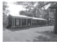
GREENBUSH 1 flr. living, updated, heat pump gives cheap heat & A/C. New paint, boiler & on demand HW, newest metal roof, spacious backyard. $113,900 Kurtis & Carissa Marsh, 942-6310