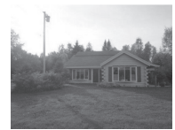
CORINTH Nicely updated home on spa- cious & beautifully landscaped lot. Open living w/1 flr living if desired. 3 car gar. $159,900 Kurtis & Carissa Marsh, Realty of Maine, 942-6310