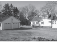
EDDINGTON 3 BR/1.5 BA home on a gentle sloping landscaped yard. Home is spotless and comes with pellet stove. Home sits upon 1.18 acres and has de- tached 2 car garage. $99,900 Adams Real Estate 990-3929