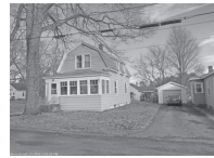
BROWNVILLE 2 BR/2 BA corner lot w/3 season porch, kit. w/open dining area. 1 car detached garage. Fully Furnished. $39,900 Nadeau/Bragdon Team, ERA Dawson, 723-1441 / 947-3363