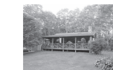
NEWBURGH 3 BR/2 BA log cabin w/ig porch, 3.3 ac, hdwd flrs, lg f.p. in LR, basement w/fam. rm & complete kit. 2 car det. gar. $179,900 Nadeau/Bragdon Team ERA Dawson 723-1441/947-3363