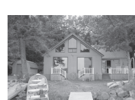
T3 R9 NWP 3 BR 1 BA on Cedar Lake. 125' water frontage on .81 ac. Open fir plan kit/LR w/glass drs, stained wd- work, cath. ceilings, 2 separate storage bay garages $199,900 Nadeau/Bragdon Team ERA Dawson 723-1441/947-3363