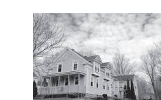
HAMPDEN 1840 home w/orig. ship port win. In-law apt. Over $74,000 into im- provements including Granite Counters! $199,000 Vacationland Realty, Jean Jenkins, 745-4522