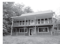
EBEEMEE TWP Log home, 3BR/2BA on Ebeemee Lake w/150' water front. 1.09 ac., unique style pellet stove. Detached lg 2 bay gar. Automatic Generator. $279,900 Nadeau/Bragdon Team, ERA Dawson, 723-1441 / 947-3363