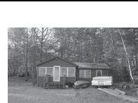
T2 R9 WELS 1 BR/1 BA cabin at base of Mt Katahdin on Millinocket Lake. Re- done in 2010, 179 ft water frontage. 62 acs., lg outblids & decks. Yr round rd ac- cess. $169,900 Nadeau/Bragdon Team ERA Dawson 723-1441/947-3363