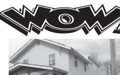
MILO 6 BR/3 BA. 18 Water St. Water view Rent to Own. In back of house is in law apt, large family or extra income. Original hardwood floors. Large yard in quiet neighborhood. Close to park and boat landing. $850. 943-2224 or 299-4999 $170,000