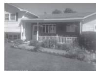
CORINTH Spacious tri-level, 4.8 acs, landscaped, family rm, ctrl vac, brick hearth w/wd stove, 2 car gar. & wkshop, barn for storage/livestock $189,900 John Voye, 852-6056, Realty of Maine