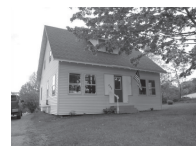
ORRINGTON Nice 4 BR cape w/im- provement. Original hdwd flrs, tin ceil- ings, living room, family room, dining area, nice garden spot and close to Bangor. $105,000 John Voye, 852-6056