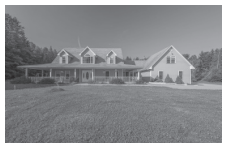
CORINTH, OPEN HOUSE 717 TATE RD CORINTH ME, AUG 20, 2016 CORINTH, Aug. 20, 2016 11:00 AM-12:30 PM 4BR/ 3.5 BA 717 Tate Rd Corinth Me, 4Bdrm 3.5 Bath, MLS#1276523 $298,000Keller Williams Realty Bangor