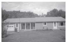
BANGOR 2 BR/1 BA Beautiful ranch on 1.2 acres on Stillwater Avenue with attached garage. Completely remodeled with new windows, new bath, new kitchen, and new septic. Den could be used for 3rd bedroom. Beautiful back yard only one mile from Bangor Mall or 1/4 mile from nature trail. Need to see to appreciate. $159,900 207-945-9885