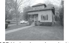
BANGOR Updated, spacious double lot, fenced backyard w/decks. Gourmet kit, granite counters. SS, 2 new BAs. Real hdwd frs. $209,900 Kurtis & Carissa Marsh, Realty of Maine 942-6310