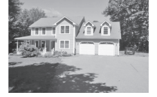
BANGOR 4BR Colonial w/3BA. Lg. pvt. backyard, deck & screened porch. Maple frs, new SS appliances, pellet stove, full base. $274,900 Kurtis & Carissa Marsh, Realty of Maine, 942-6310