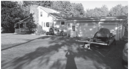
BANGOR 3 BR, 2 car gar. Back yard incl. lg deck, custom greenhouse & big, well landscaped lot. Ex. finished space in basement. $189,900 Scot Walker, 538-1765 www.maineandbroker.com