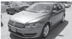
VW 2013 PASSAT 2.5 26K miles, auto, leather, alloys, $18,477. Crawford's Import Auto, 862-3971