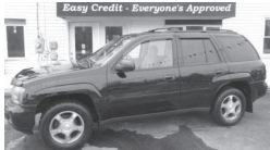
CHEVY 08 TRAILBLAZER 4WD AT 108K *EZ CAR CREDIT! YOU'RE APPROVED!* ==>>> GARRETTSAUTO.COM<<<== 1A, 2mi fr/Brewer Walmart 989-6777