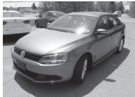
VOLKSWAGEN 2012 JETTA 26k, 5-spd, leather, roof, alloys, $15,133 Crawford Import Auto, 862-3971

All prices include Rebates, Business and Dealer Incentives. Tax & Title not included. Dealers are ineligible for advertised prices and lease. All Pending Credit Approval. Prices subject to change without notice. To qualify for GM Owner Loyalty must own a 1999 or newer GM vehicle. Not required to trade. Offer can be transferred to individuals residing in same household. Proof must include copy of registration, current lease contract or payment coupon. Sale prices for this ad end June 18, 2015. While Supplies last.