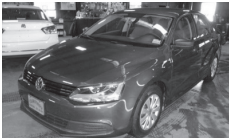
VW 2012 JETTA 20k mi., 5-spd, one owner, $12,925. Crawford's Import Auto, 862-3971

DODGE - 2000 FLORIDA Grand Caravan Zero rust, all power options, very nice, 165k mostly hwy. Needs brakes. Reduced to $2,500/obo. Call for pictures 226-7540.