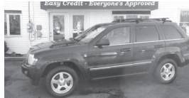
JEEP 05 G. CHEROKEE 4WD AT 102K *EZ CAR CREDIT! YOU'RE APPROVED!* ==>>> GARRETTSAUTO.COM<<<== 1A, 2mi/fr Brewer Walmart 989-6777