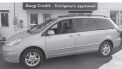
2006 TOYOTA SIENNA LTD AWD 133K *EZ CAR CREDIT! YOU'RE APPROVED!* ==>>> GARRETTSAUTO.COM<<<== 1A, 2mi fr/Brewer Walmart 989-6777

SUZUKI 2006 BURGMAN 400 5750 miles, like new, $2,000 Call 207-478-1715