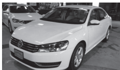
VOLKSWAGEN 2012 PASSAT 2.5 29k mi., auto, leather, sat. radio, $17,777 Crawford's Import Auto, 862-3971