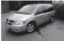
DODGE 2007 GRAND CARAVAN Stow & go. Real clean. 84k miles. $7,500. 207-974-8818

All prices include Rebates, Business and Dealer Incentives. Tax & Title not included. Dealers are ineligible for advertised prices and lease. All Pending Credit Approval. Prices subject to change without notice. To qualify for GM Owner Loyalty must own a 1999 or newer GM vehicle. Not required to trade. Offer can be transferred to individuals residing in same household. Proof must include copy of registration, current lease contract or payment coupon. Sale prices for this ad end September 13, 2016. While Supplies last.