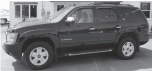
CHEVY 07 TAHOE LT 4WD AT 165K *EZ CAR CREDIT! YOU'RE APPROVED!*

CLASS A, MOTOR HOME 2001, 36FT 2 large slide outs, V-10 ford engine, 39,000 miles. satellite dome,new tires. Never seen snow. $19,995 207-944-2115