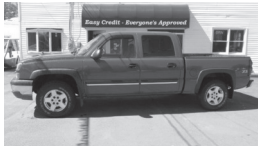
CHEVY SILVERADO 05 4WD AT V8 180K *EZ CAR CREDIT! YOU'RE APPROVED!*

====>GARRETTSAUTO.COM<==== 1A, 2mi/fr Brewer Walmart 989-6777