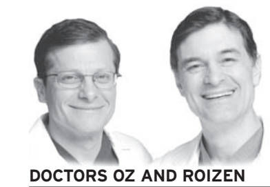
DOCTORS OZ AND ROIZEN

Such scams are common, and they're not just financially dangerous! The editor of Public Policy & Aging Report put it succinctly: Elder financial abuse "... damages health, harms wellbeing and arguably costs lives." Scam artists know that the elderly often have cognitive issues and may be easily scared. So here's how to help your older friends and family members counter scams. —Tell them about scams to watch out for in addition to the IRS scam: Calls from supposed grandkids asking for money for an emergency;