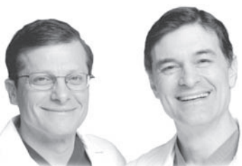
DOCTORS OZ AND ROIZEN