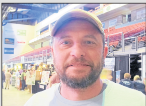
"Lamoine State Park."