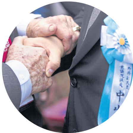
A powerful handshake of friendship on the island of Iwo Jima on March 21, 2015. Japanese and American survivors of the fierce 1945 battle returned to the island for a Reunion of Honor on the only battlefield where former enemies come together in friendship.